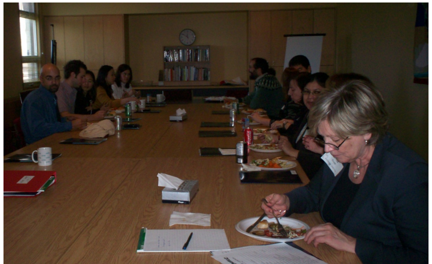
New Members' Luncheon held on October 28, 2008, in the UMFA Boardroom.